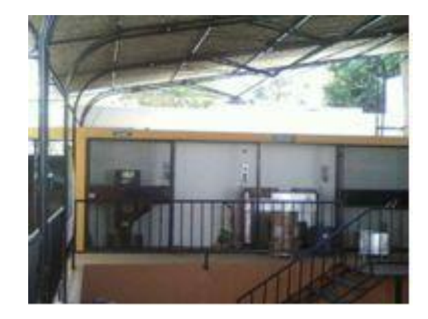
Authorised e-Waste collection centre at Kasa Rasa, Koramangala

Mother Earth, Landmark, Koramangala 3<sup>rd</sup> Blk, Jayanagar LIC Colony, Hippocampus, British Library