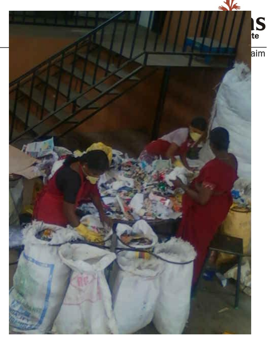
KASA RASA OPERATIONS: Segregation, composting and storage