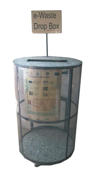
Bin for collection of larger e-waste –

Bin for collection of used CDs, Batteries and floppies – at public points, apartments and offices.