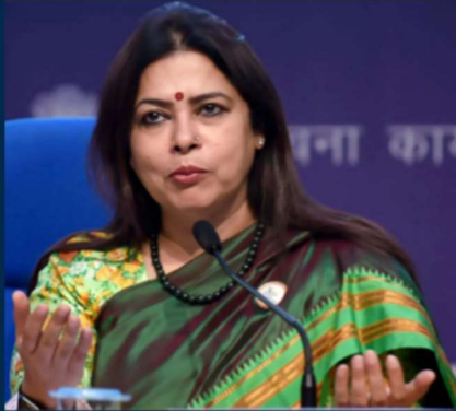
Smt Meenakashi Lekhi, Former Minister of State for External Affairs and Culture, and Member of Parliament

"Global discussions now focus on transitioning to zero carbon buildings, adopting circular economy principles, and enhancing urban climate resilience. The GRIHA summit is very relevant from this global perspective,"