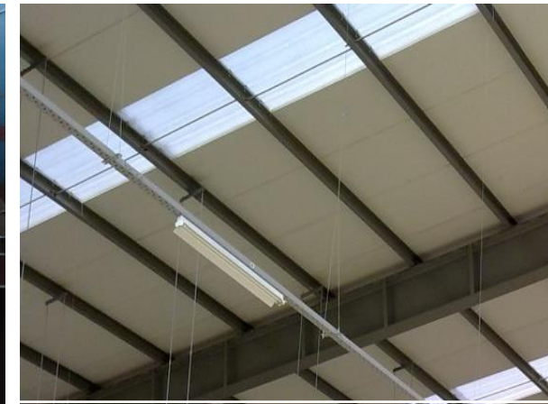
Natural light & Use of CFLs