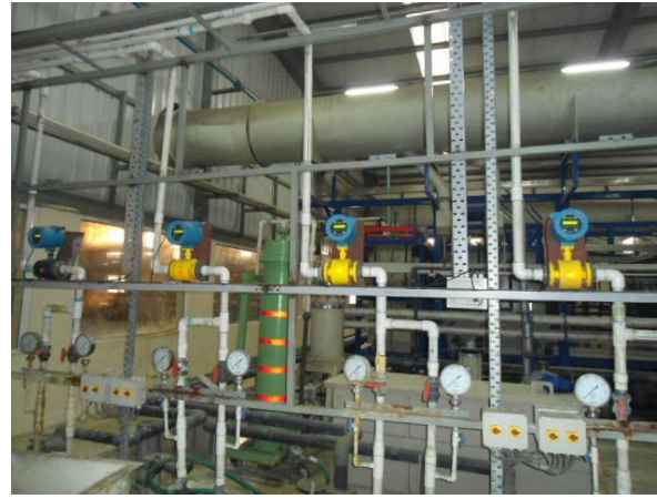
Reuse of 70 % water in process after treatment