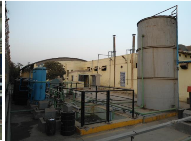
STP water for gardening