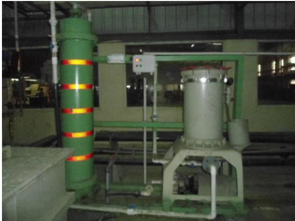
Recovery of heavy metals (Ni & Cr)