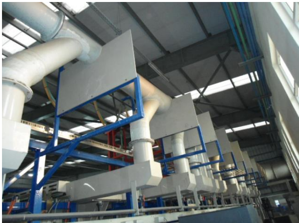
Fume extraction with Scrubber at Electroplating