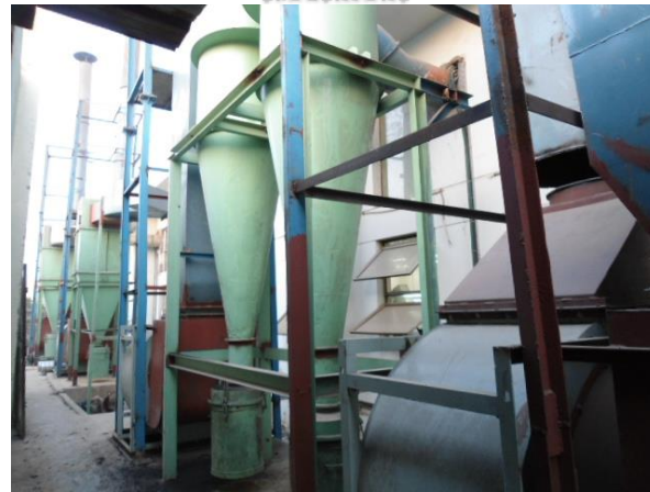
Dust Collector at GP