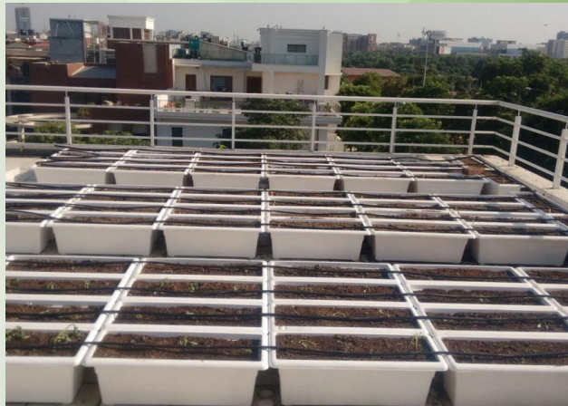
DRIP IRRIGATION SYSTEMS