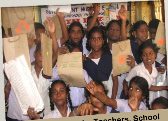
Schools – Students, Teachers, School Administration