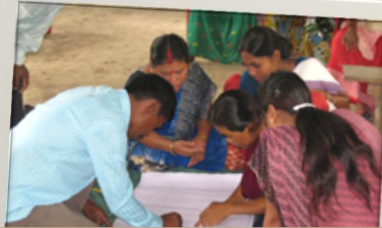
Communities – rural and urban