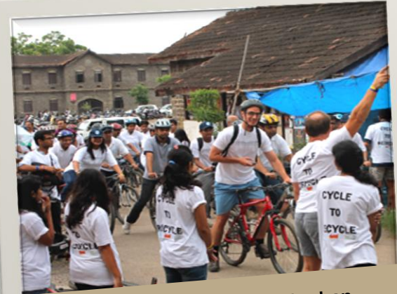
Youth Groups – rural and urban