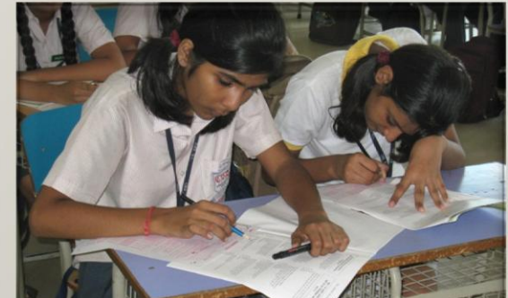
Women and girl child