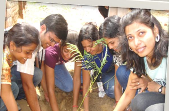
Colleges, universities, institutes – undergraduates, postgraduates