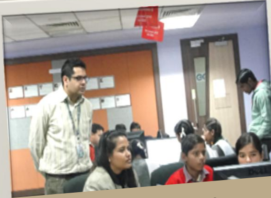
Corporates - employees