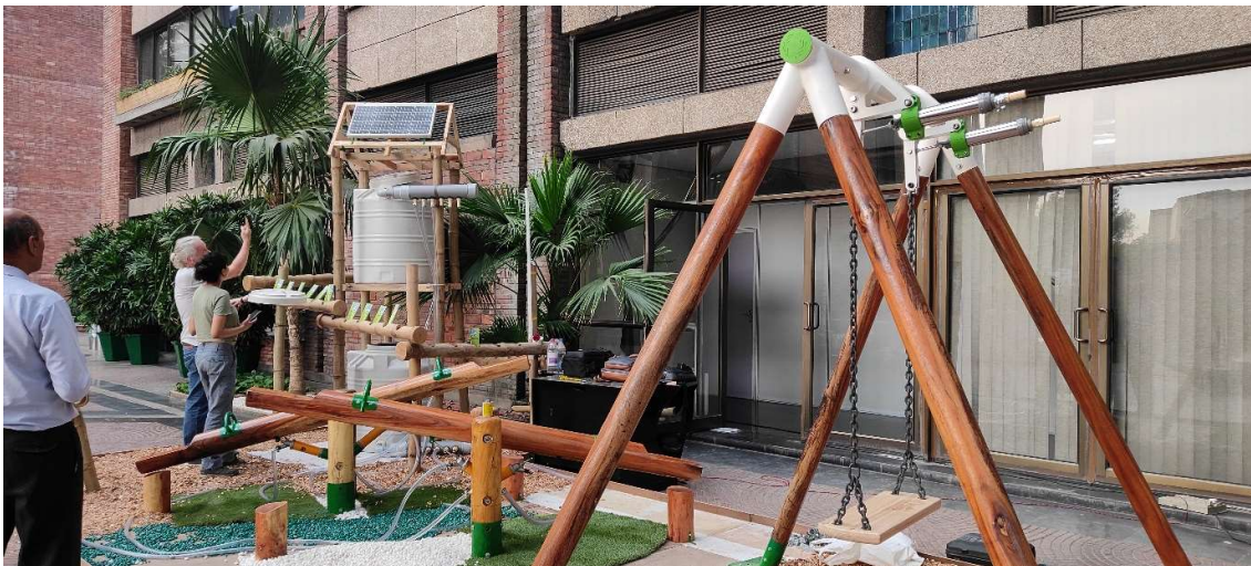
Figure 2: Playponics – A Hydroponics Playground