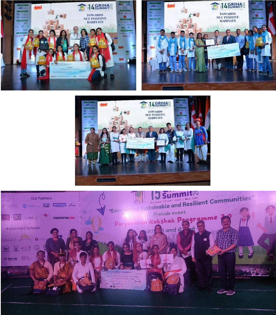
Figure 3: Awards received by schools in Paryavaran Rakshak Programme